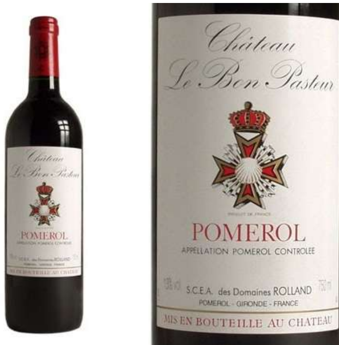
1979 Le Bon Pasteur (1.5L) | Ex Chateau

Below Le Bon Pasteur stock from 1979 to 2010 vintages - all Ex-Chateau and Pre-Arrival