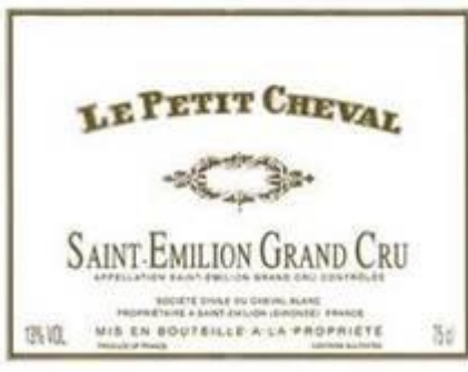
Petit Cheval 2004 (2 nd label of Cheval Blanc)

RP 87 £1,100 per cs of 12 (estimated HK$1,200/btl !!)