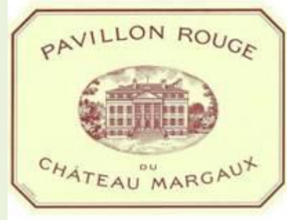
Pavillon Rouge du Chateau Margaux 2001 (1500ml) (2 nd label of Margaux)

WS 93 £730 per cs of 6 (estimated HK$1,585/btl !!)