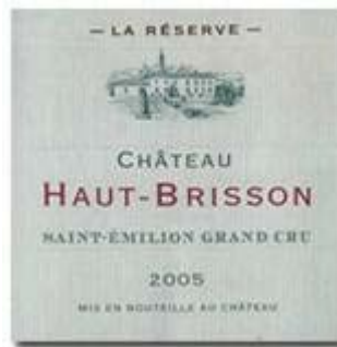
Haut Brisson Le Reserve 2005