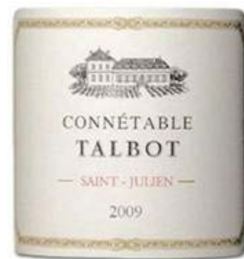
Connetable de Talbot 2009