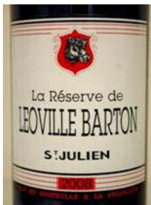
Reserve de Leoville Barton 2008