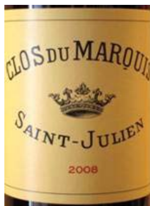
Clos du Marquis 2008