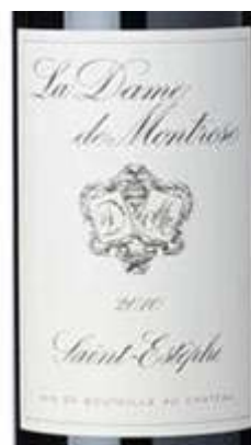
Dame De Montrose 2010