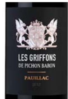
Griffons de Pichon Baron 2009