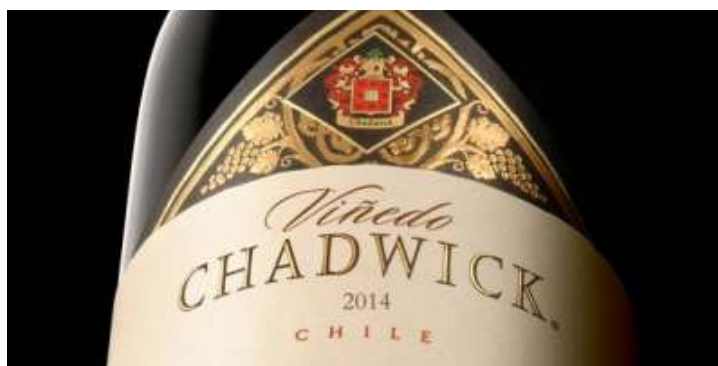
VINEDO CHADWICK 2014